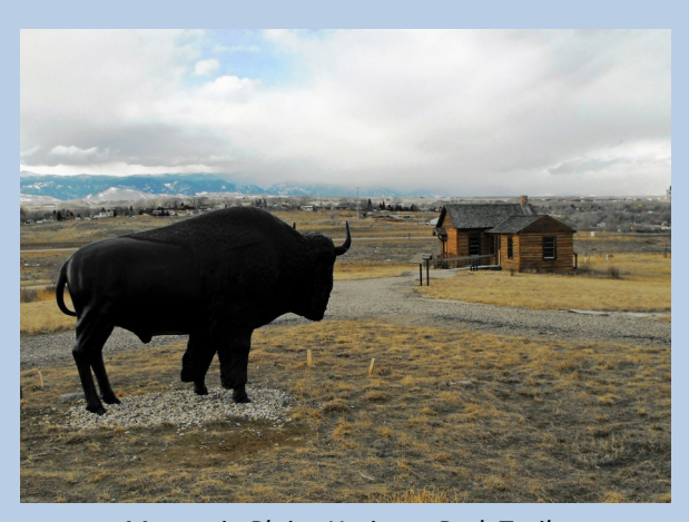
Mountain Plains Heritage Park Trail