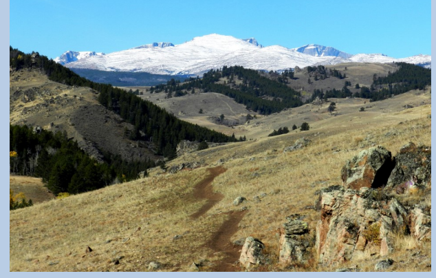
Grouse Mountain Trail

While in the Buffalo area enjoying the Clear Creek Trail System, we invite you to stay a while to visit the many famous historical sites, enjoy the spectacular scenery and take advantage of the many sporting opportunities. Learn about the culture and conflicts of the Plains Indians and revisit western history at the Jim Gatchell Memorial Museum. Walk along the famous Bozeman Trail as did the gold seekers in the 1860s. Get western...feast at our great local restaurants, and Bed down beneath the Bighorn Mountains at one of our excellent hotels, motels or campgrounds.